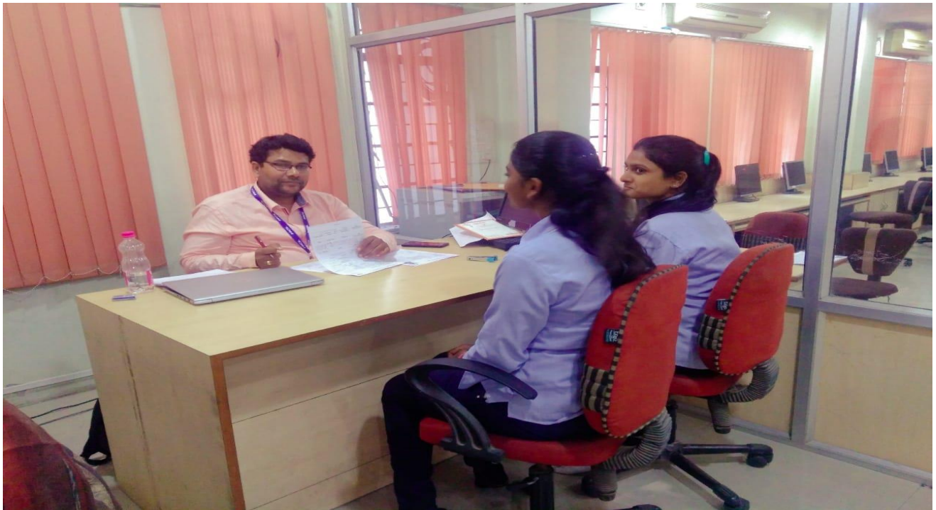
Organized Recruitment drive which is being conducted "HCL Technologies, Nagpur"